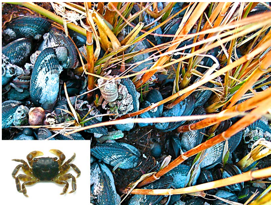
PLATE 1. Cordgrass facilitates ribbed mussels and other intertidal organisms by ameliorating thermal and desiccation stress. Ribbed mussels, in turn, facilitate other species by providing a hard settlement substrate for species including barnacles and crevice space for mobile species such as littorine snails and the invasive Asian shore crab (inset). This facilitation cascade thus enhances both native diversity and the success of invasive species.

scale that can drive broader positive diversity-invasibility relationships (Shea and Chesson 2002, Huston 2004). Our findings thus answer affirmatively the fundamental questions of whether facilitative interactions affect the relationship between native and invasive species, and whether they do so on a scale detectable by experiments (Bulleri et al. 2008).